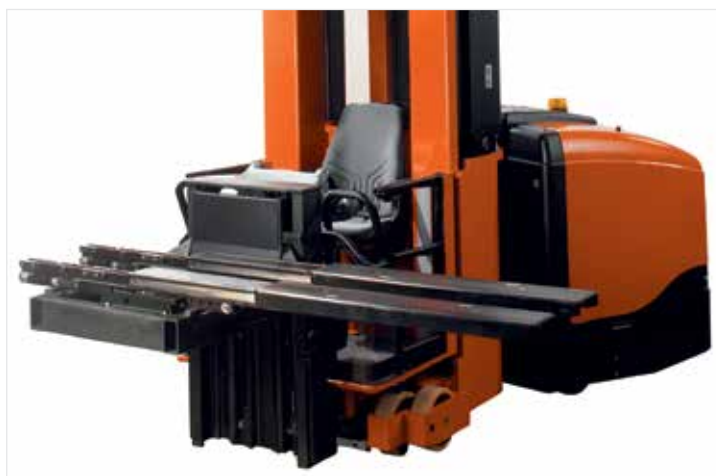
Shuttle-fork version offers maximal productivity