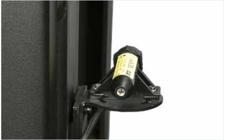
Aisle camera option