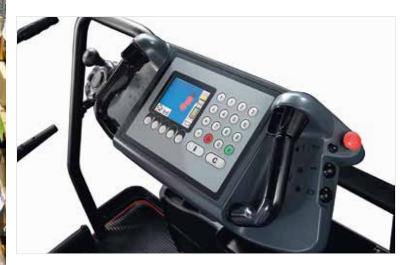
Integrated control panel