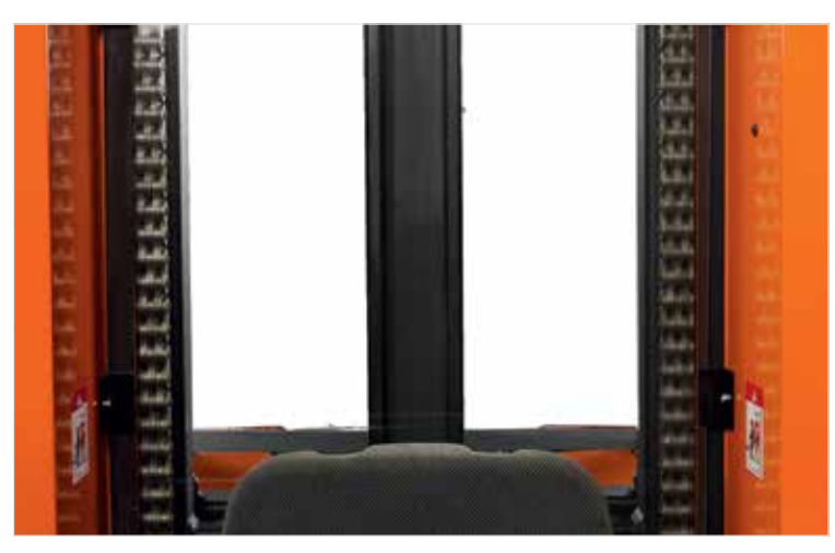
BT Totalview allows optimum visibility