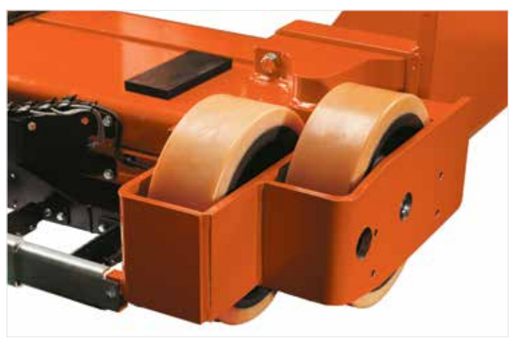
Staggered front wheel arrangement increases stability while reducing floor loading