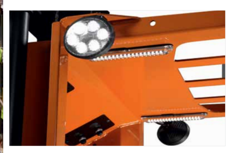
LED working lights are powerful and efficient