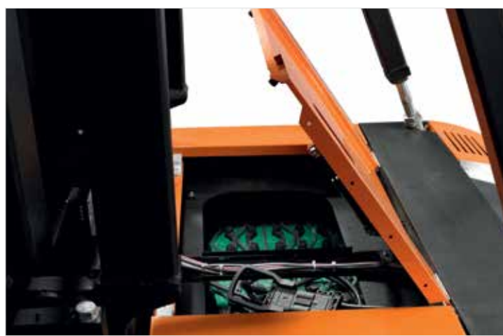
Battery access is convenient for charging