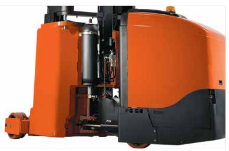
The A-series' BT Advanced Lifting System significantly reduces the amount of battery energy required to lift the cab and load, allowing two-shift operation on a single charge