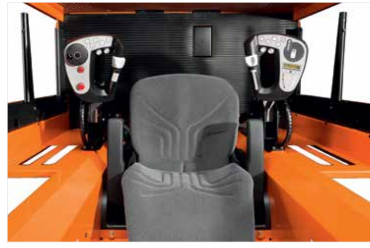
Split control panel lets the operator reach the pallet easily for order picking